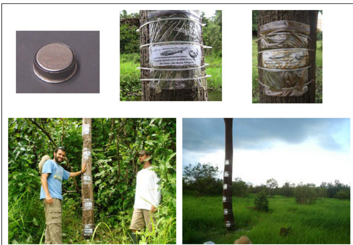
Figure 2: Upper: Thermochron iButton; iButton mount at installation; iButton mount at retrieval. Lower: Examples of iButton stations