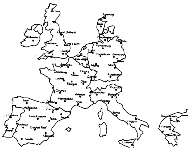
Fig 1 Location of th 53 sites

To monitor EC agriculture the number of sites must be large enough to be representative of European farmland. Within the limits of cost, practicability and available processing resources briefly mentioned above, the number should be as large as possible. For Action 4, the CEC Joint Research Centre (JRC) decided to cover 6% of Europe's utilized agricultural area (UAA) using a set of 53 sample sites, each measuring 40 km x 40 km, and covering all 12 EC countries (figure 1).