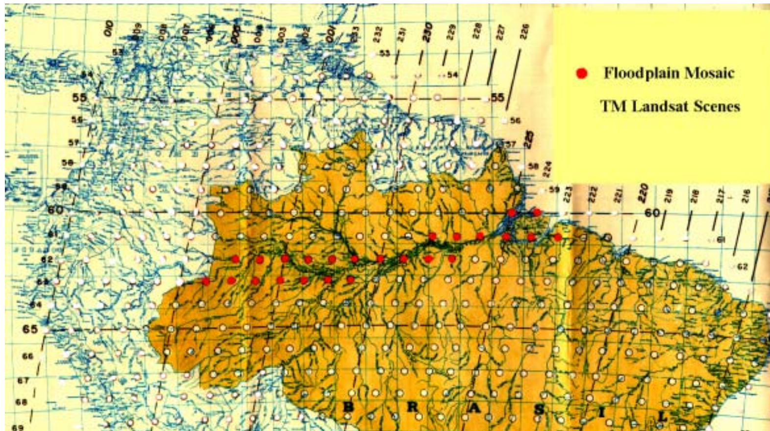
Figure 1 - Landsat scenes to be used to build the floodplain mosaic.