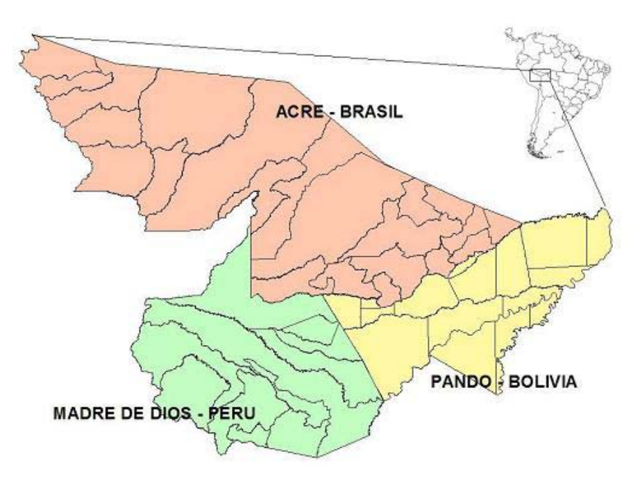
Figure 1: Region frontier of Madre de Dios-Peru, Acre-Brazil, and Pando-Bolivia, called MAP region.